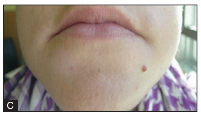
Figures 1A, 1B, and 1C. (A) A 15-year-old girl with facial flat warts (mainly on her chin); (B) substantial improvement three weeks after treatment; (C) facial flat warts seven weeks after treatment.

patients (Figures 1, 2, 3). Four patients (2 male and 2 female) complained of severe irritation with erythema, which diminished when the dose was reduced to one application every two days (Figure 4). No noticeable side effects were recorded. Four patients had received previous treatment with salicylic acid, two patients had received cryotherapy, and one patient had received retinoic acid. The side effects were observed among the patients who did not receive previous therapy.